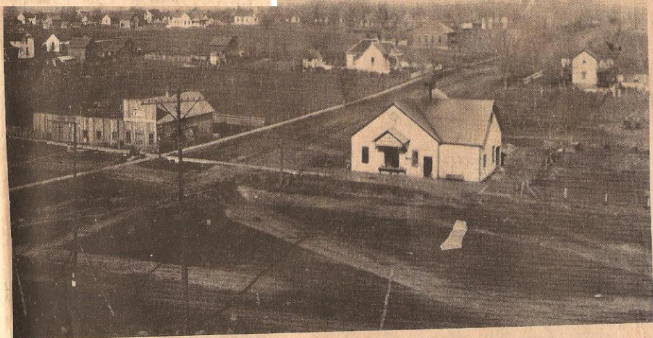
A view of Alma, facing the northeast, taken about 1920.